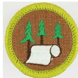
PULP AND PAPER

Preparation: Requirement 7, 4b, 5a prior to camp.