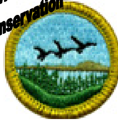
FISH & WILDLIFE MANAGEMENT