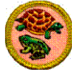
REPTILE & AMPHIBIAN STUDY