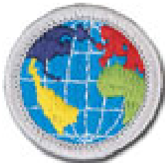
CITIZENSHIP IN THE WORLD