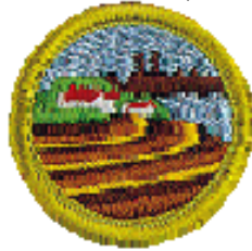
SOIL & WATER CONSERVATION