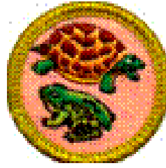
REPTILE & AMPHIBIAN STUDY