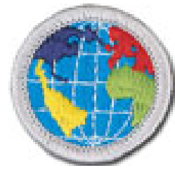
CITIZENSHIP IN THE WORLD

Preparation: requirements 2, 3, 6, and 8 prior to camp