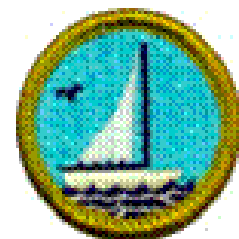
SMALL BOAT SAILING

Preparation: Must have Merit Badge Pamphlet.