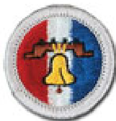
CITIZENSHIP IN THE NATION

Preparation: requirements 2, 3, 4, and 7 prior to camp