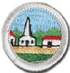
CITIZENSHIP IN THE COMMUNITY

Preparation: Recommend Scouts be at least a 3rd year camper or 14 years of age.