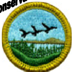
FISH & WILDLIFE MANAGEMENT